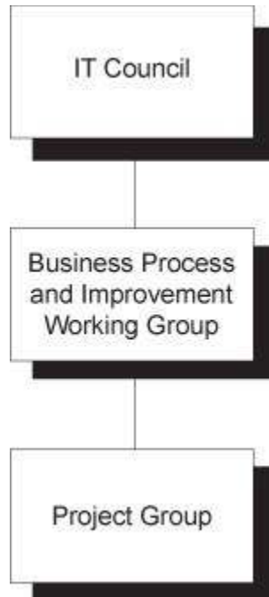
Figure 1: 'us' – Utility Services BPM Governance Structure