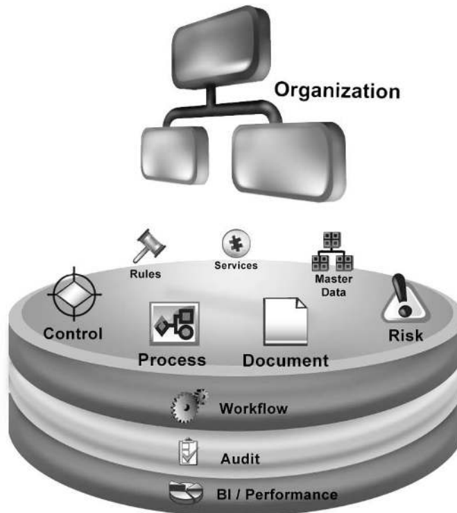
Figure 4: Interfacing Enterprise Process Center® Modules